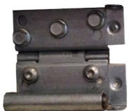
Wayne Dalton Pinch Proof

If your existing hinges look like one of these examples, stop installation. The Green Hinge System is not interchangeable with these hinges.